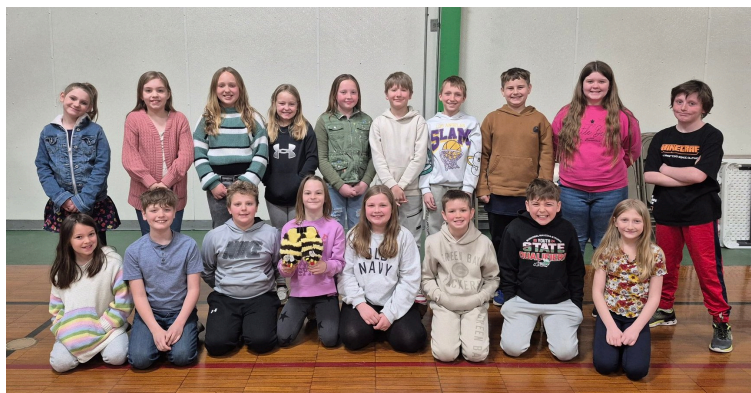
Silent Slipper - 4th grade