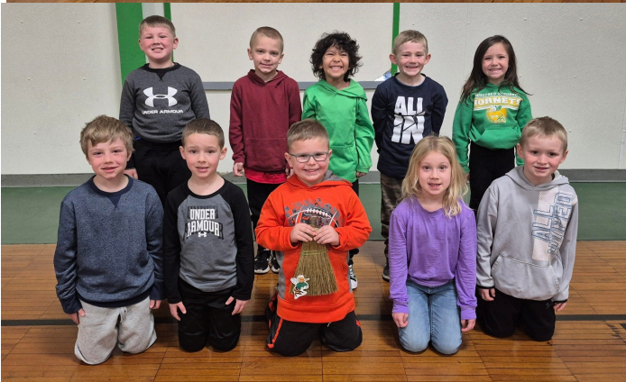
Buzzing Broom - Kindergarten