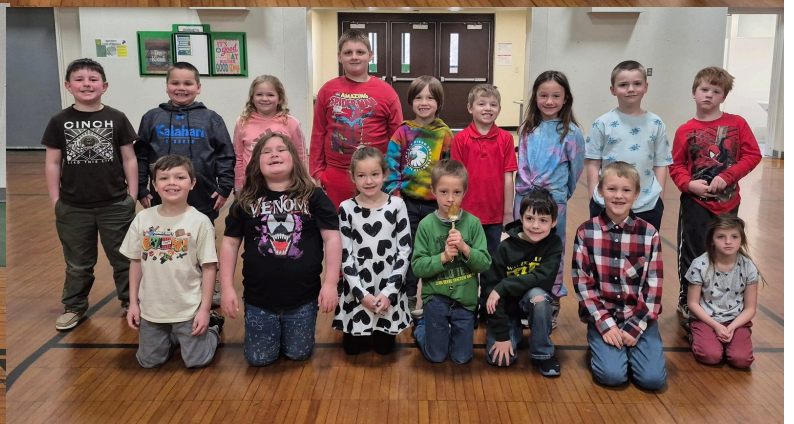
Golden Spoon - 1st grade